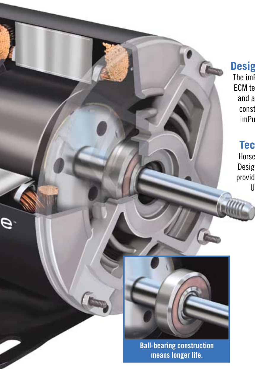
Ball-bearing construction means longer life.