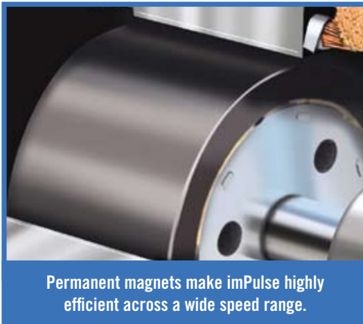
Permanent magnets make imPulse highly efficient across a wide speed range.

designers can program new and better functionality into the pump motor. The result is a variable-speed pump motor, whose nearly unlimited range of operating speeds, give it the unprecedented ability to execute programmed commands.