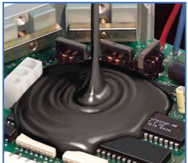
Potted electronics make imPulse highly reliable, even in damp locations.

Horsepower: 1.8 HP • Speed: 400-4000 RPM • Voltage: 230V • Design: NEMA 56-frame Interface: Digital Serial Interface (DSI) provided by Spa OEM • Bearing System: Ball Bearings • UL-approved • Permanent Magnet Brushless DC